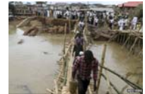
102 killed in Nigeria after Eleyele dam collapses in heavy rains