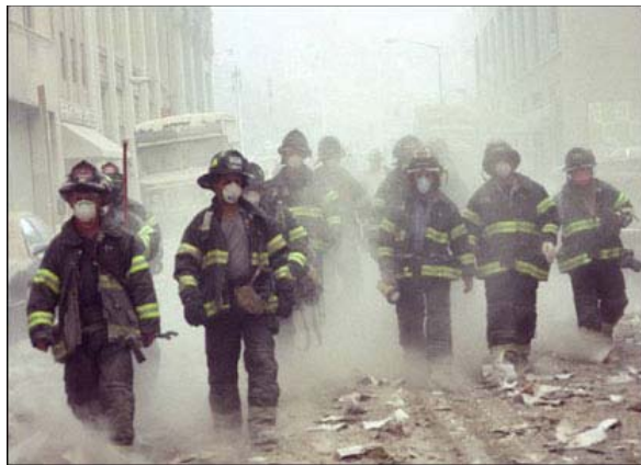
There is a high burden of physical and mental illness in the 50,000 rescue and recovery workers.

Read more on World Trade Centre firefighters 9/11 rescue workers