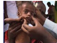
UN calls for urgent aid as Somali famine is killing 100 kids a day