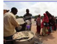
Somali soldier kills 5 refugees, injures 3 in rush for food