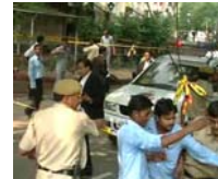
Blast at Delhi High Court kills 9, injures 45

US teen Hannah Blyth finds 22 new asteroids, hopes to have one named after her 9/11 rescue workers face higher cancer risk: Lancet 5 Uruguayan peacekeepers accused of raping Haitian teen in UN base 102 killed in Nigeria after Eleyele dam collapses in heavy rains 1000 DR Congo prisoners escape Lubumbashi jail after gunman attack