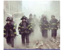
9/11 rescue workers face higher cancer risk: Lancet